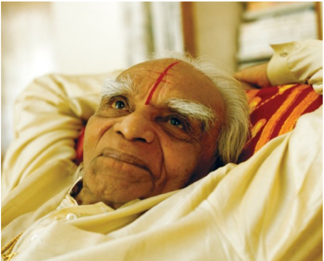
Sri BKS Iyengar relaxes in his living room. Pune. 2008.